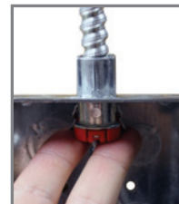
Squeeze tabs to release fitting for removal