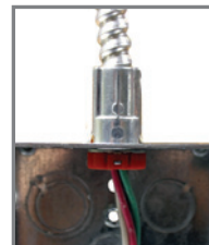
Snap into knockout from inside the box